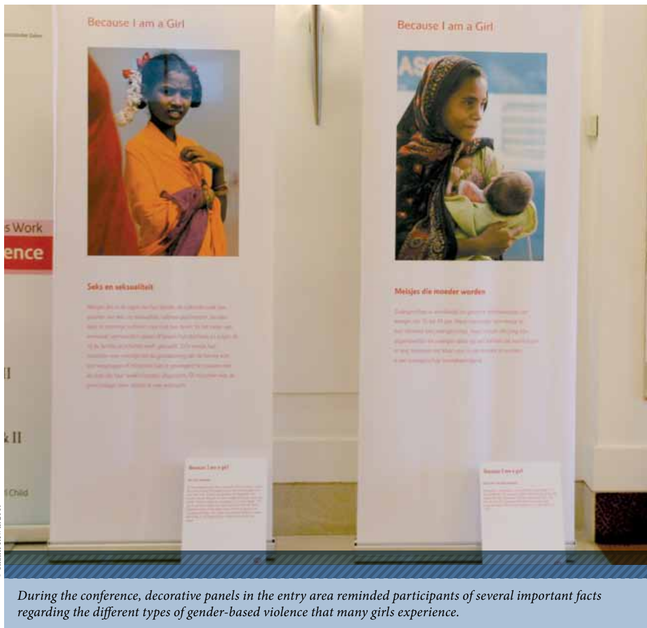
During the conference, decorative panels in the entry area reminded participants of several important facts regarding the different types of gender-based violence that many girls experience.