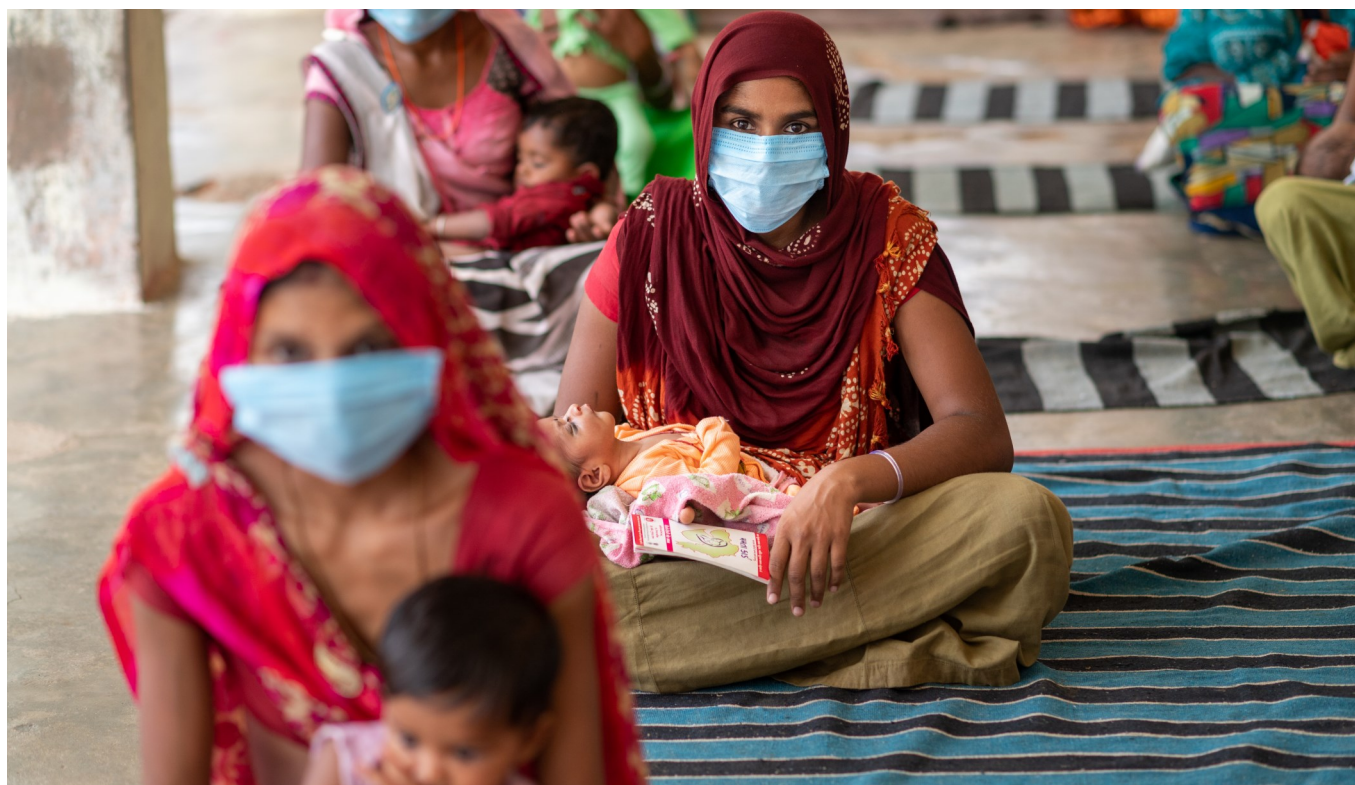
Social distancing in seating is ensured at Mamta Diwas(VHND) at Chanota Fadia, Gujarat.