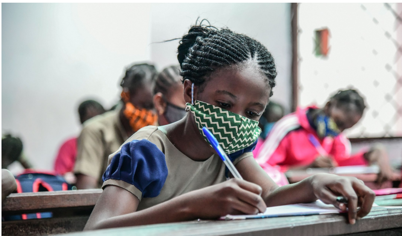
In Congo, children are back to the classrooms after months spent at home due to school closures due to COVID-19.

Art-based therapies, including mindfulness-based art therapy, have shown promise to increase children's well-being and reduce psychological distress. Results from this pilot and feasibility study show that both an emotion-based directed drawing intervention and a mandala drawing intervention may be beneficial to improve mental health in elementary school children, in the context of the current COVID-19 pandemic, and that the implementation of both interventions online and remotely, through a videoconference platform, is feasible and adequate in school-based settings.